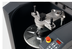
Clamping handles placed in front: operators stand comfortably