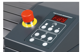
Great for peak hours: 3 speeds up to 230 rpm